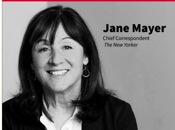
Jane Mayer Chief Correspondent The New Yorker